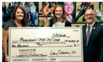
Mooseheart Child City & School