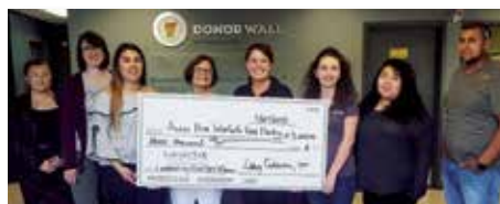
Aurora Interfaith Food Pantry