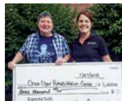
Open Door Rehabilitation Center